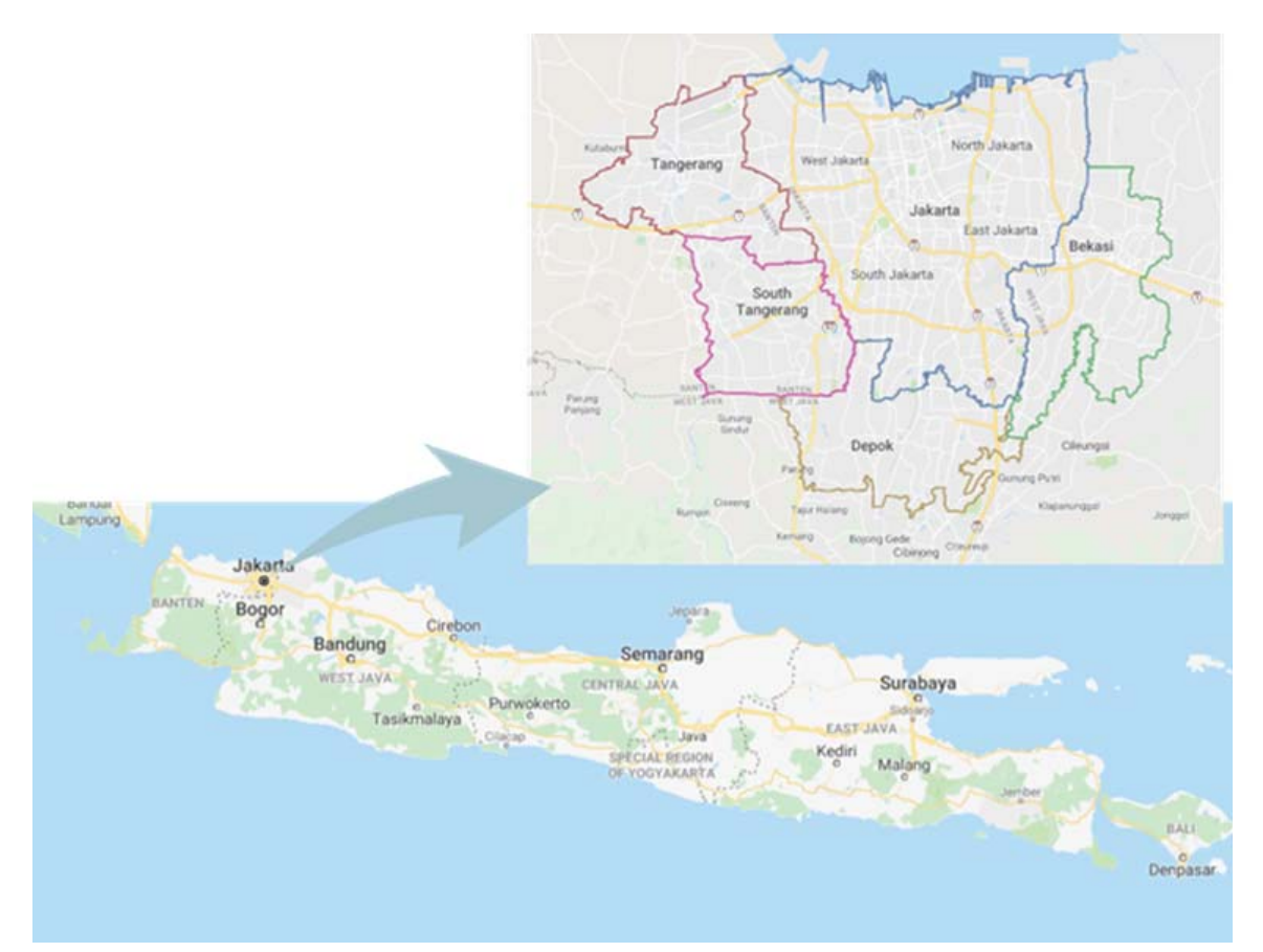
Figure 1: Study area covering Jakarta, Depok, Tangerang, South Tangerang and Bekasi, Java Island, Indonesia

of Indonesia suffers from high traffic accident frequency and high level of service and congestions which also lead to traffic safety problems. With the total number of 4,646 records of pedestrian accidents in 2016 from Jakarta and the immediate neighboring municipalities: Depok, Tangerang, South Tangerang and Bekasi (Fig. 1) (IRSMS) [16], an in-depth analysis of how changes in different factors affect the levels of severity of pedestrian accidents is of paramount importance.